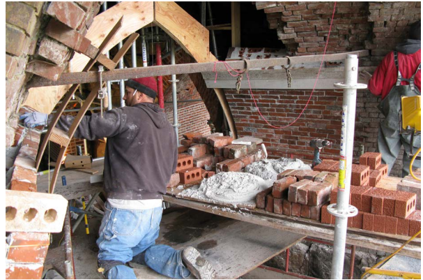
Oswego IronWorks arch reconstruction, Lake Oswego

The general contractor will play an equally important role in your project and the complexity of the restoration should guide their selection. Whereas not all capable contractors will have directly relevant experience, such as theater rehabilitation, they should, at a minimum, be familiar with the challenges of working on historic properties. The contractor is responsible for determining the construction budget, schedule, and performing the work. Having the contractor involved early also provides feedback on the impact of design choices and helps to assess construction costs associated with them. A contractor can also provide guidance on whether or not your project could be phased over time to spread out costs.